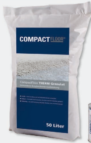
CompactFloor THERM PU 50 Liter (granulate + binder) Item No. 2 02 710